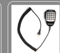
Keypad microphone SM07R1