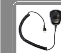
Palm microphone SM07R2