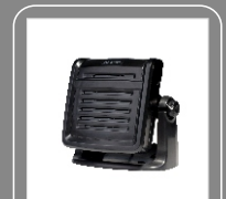
External speaker SM09S2