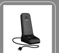
Desktop Microphone SM10R2