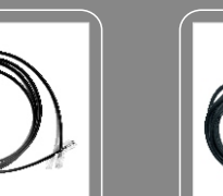
Programming cable PC21

The high-performance, yet simple-to-use TM-628H mobiles are created to give you the immediate, reliable communication you need to keep mobile teams working efficiently. HYT's voice compander audio enhancement and a powerful 5W internal or 13W external speaker ensure superb clear, crisp sound, even in noisy environments. It's compact design makes these radios ideal when mounting space is a constraint.